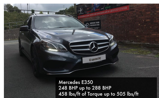
Mercedes E350 248 BHP up to 288 BHP 458 lbs/ft of Torque up to 505 lbs/ft

Charlie Daniels - Skoda Superb TD1 "Absolutely delighted and it is the 3rd Tunit I have had. A brilliant piece of kit giving 34 more BHP according to the dyno"