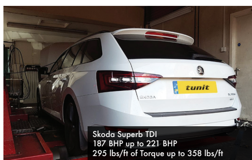
Skoda Superb TD1 187 BHP up to 221 BHP 295 lbs/ft of Torque up to 358 lbs/ft

Jonathan Platt - Audi A7 3.0 V6 "despite only driving it for a couple of days that initial lag has disappeared"