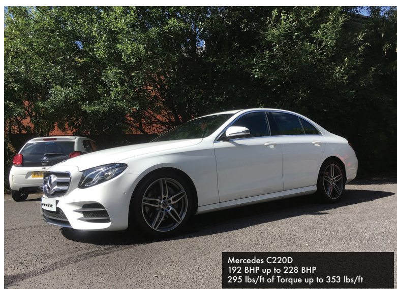
Mercedes C220D 192 BHP up to 228 BHP 295 lbs/ft of Torque up to 353 lbs/ft

"Excellent performance. I did not think my engine could improve but it did and now I don't even feel the horse box on the back"