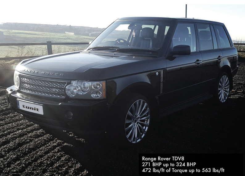
Range Rover TDV8 271 BHP up to 324 BHP 472 lbs/ft of Torque up to 563 lbs/ft

For more information on the Tunit Advantage 2B visit www.tunit.com , email info@tunit.com or call 01257 274100