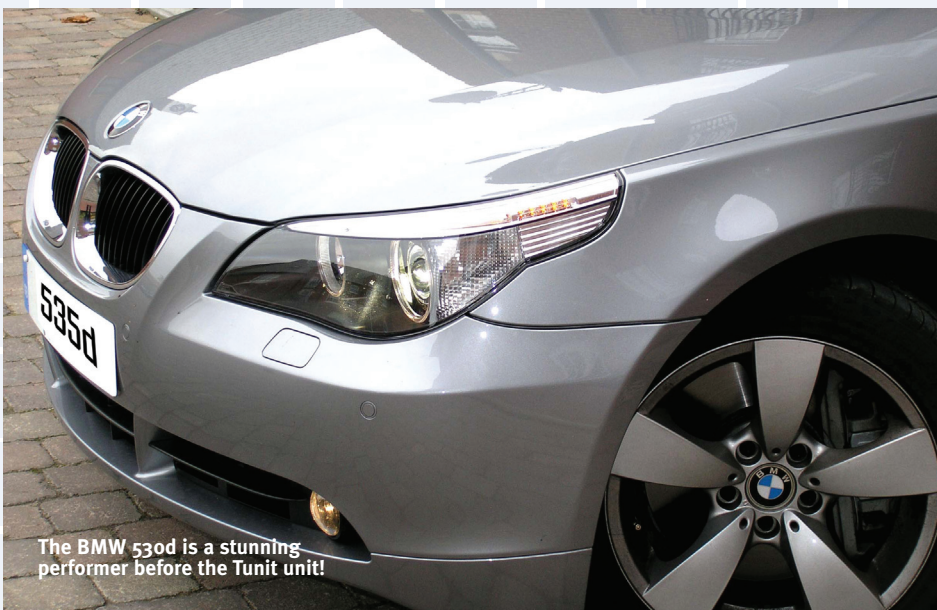
The BMW 530d is a stunning performer before the Tunit unit!

“The first run registered 293bhp and two swift adjustments to the Tunit saw this rising to 326bhp, with the calculated torque figure a massive 480 lb ft.”