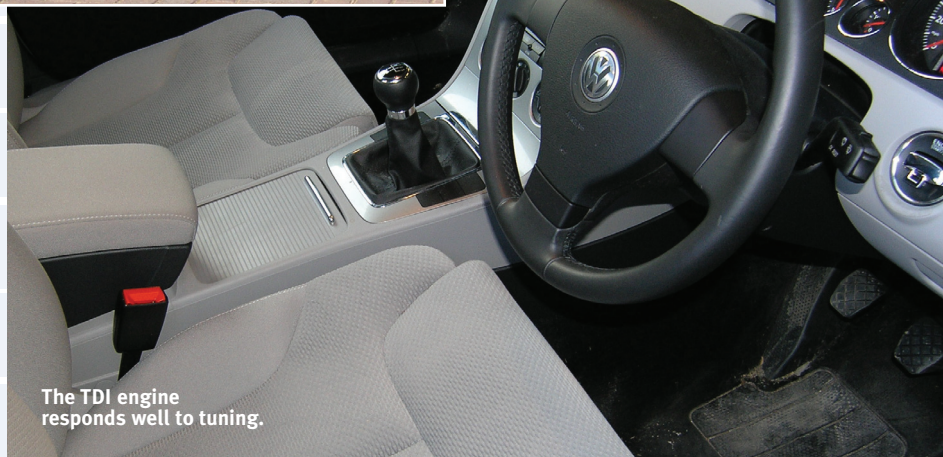
The TDI engine responds well to tuning.

available now for the 140PS (138bhp) 2.0 TDI engine that offers all the performance of the 170PS (168bhp) models, and more, at a much lower cost than the £900 odd price premium that the factory cars will inevitably carry, when they eventually arrive. The vital before and after figures for the Tunit conversion were all recorded on their high tech 1,000bhp rolling road dynamometer and, as usual with the 2.0 TDI engine, the standard figures came out well above Volkswagen's modest factory figures, with 152bhp recorded at 4,200rpm and peak